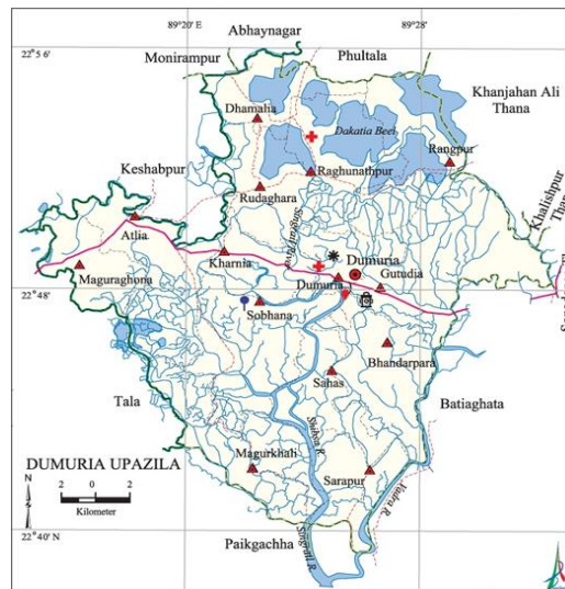
Figure 1: Map of Dumuria upazila under Khulna district showing the study area

The research was conducted following the Descript and Diagnostic Design (Kothari, 2004). It was designed to determine farm mechanization's present status and its problem confrontation. This research was census sampling. Data were collected through interviews with respondents. The study was conducted in Shovna, Khornia, and Tipna villages under Dumuria Upazila of Khulna district and Ashurkhai, Brommottor, Bakdokra villages under Saidpur Upazila of Nilphamari district. The selected areas for the study were best on time and resource availability. A map of Dumuria and Saidpur Upazila of Khulna and Nilphamari, respectively, is shown in Figure 1 and Figure 2.